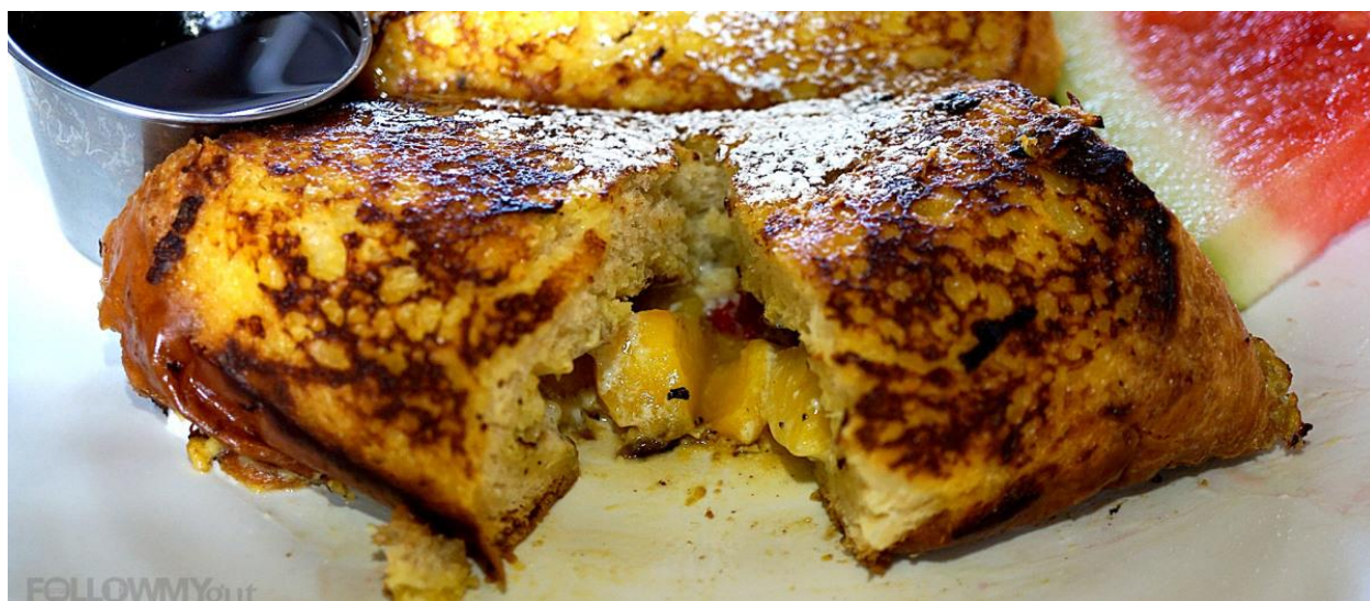
FIG TREE CAFÉ IN SAN DIEGO